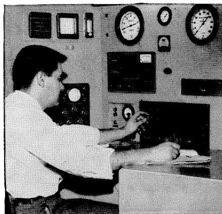
FATIGUE SPIN RIG uses compressed air to drive balls around the bore of a test cylinder to determine cylinder's static fatigue life.