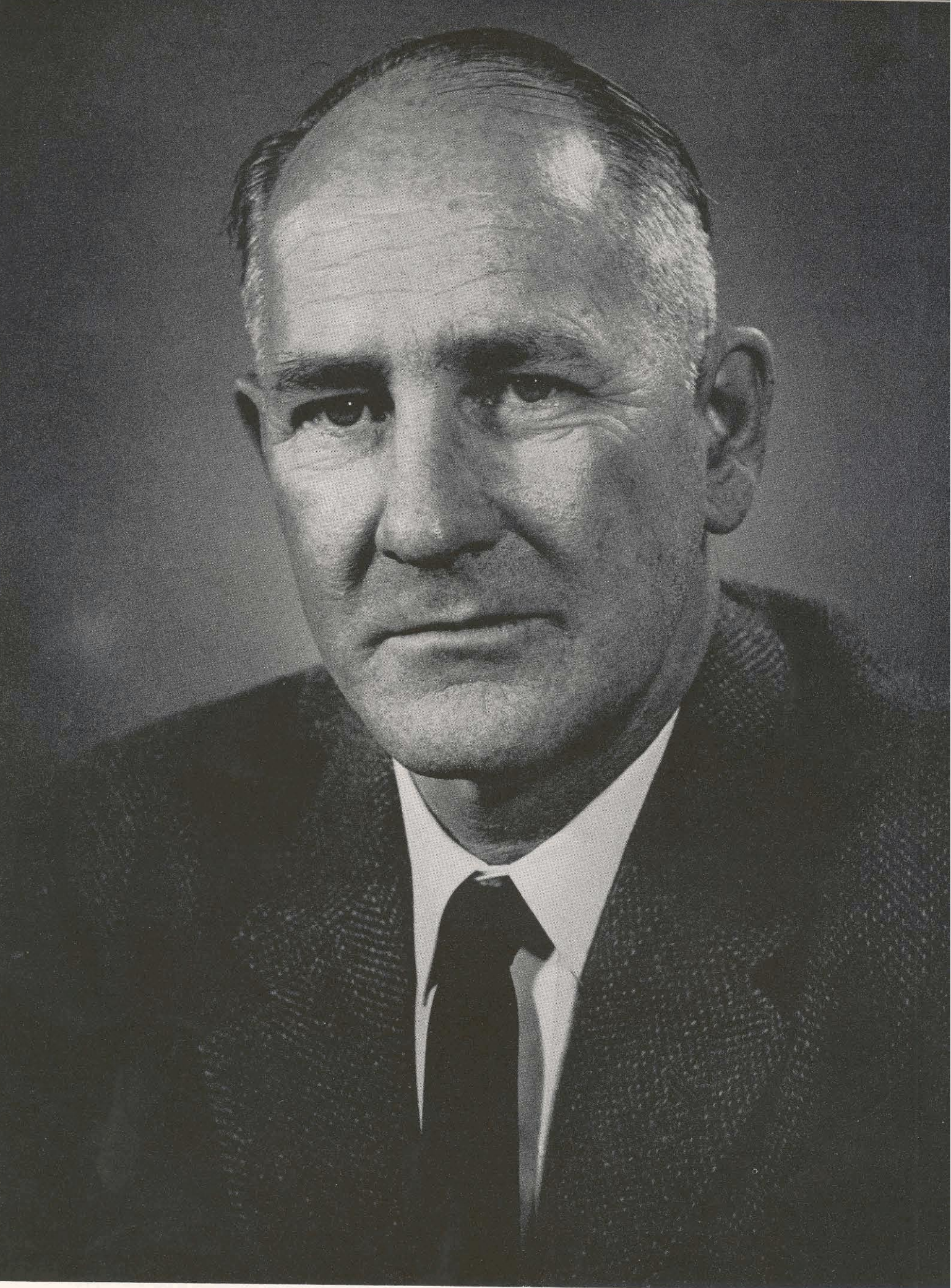
George W. Beadle, acting dean of the faculty