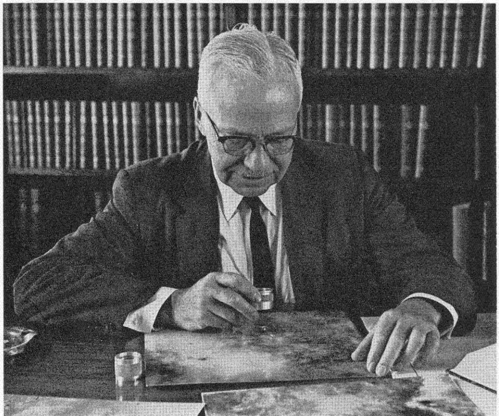
Rudolph L. Minkowski, staff member of the Mount Wilson and Palomar Observatories.

The discovery was made through Dr. Minkowski's skilled use of the telescope, and through radio signals pinpointed by astronomers at the Caltech Radio Observatory in Owens Valley.