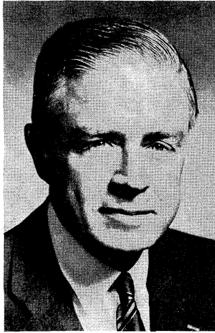
Thomas J. Watson, Jr.