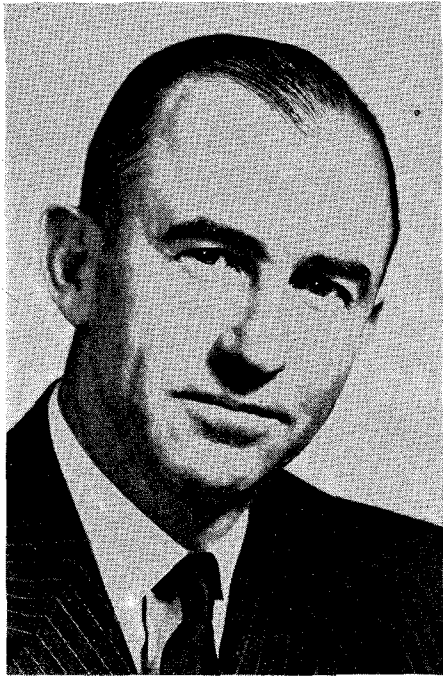
Frank Pace, Jr.