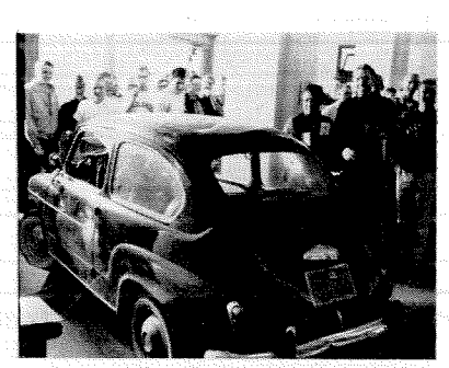
Engineering and Science