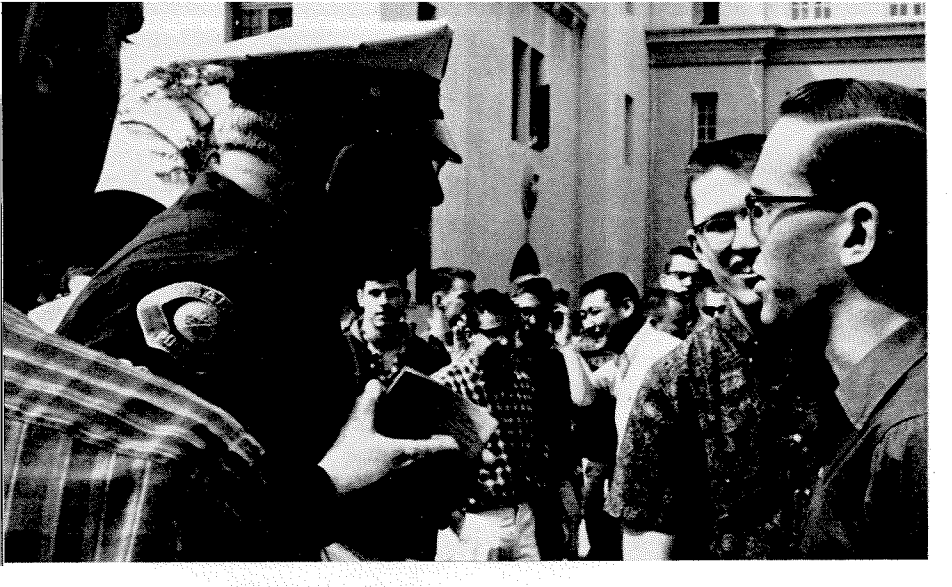
Pasadena police officer and the student body president exchange greetings.