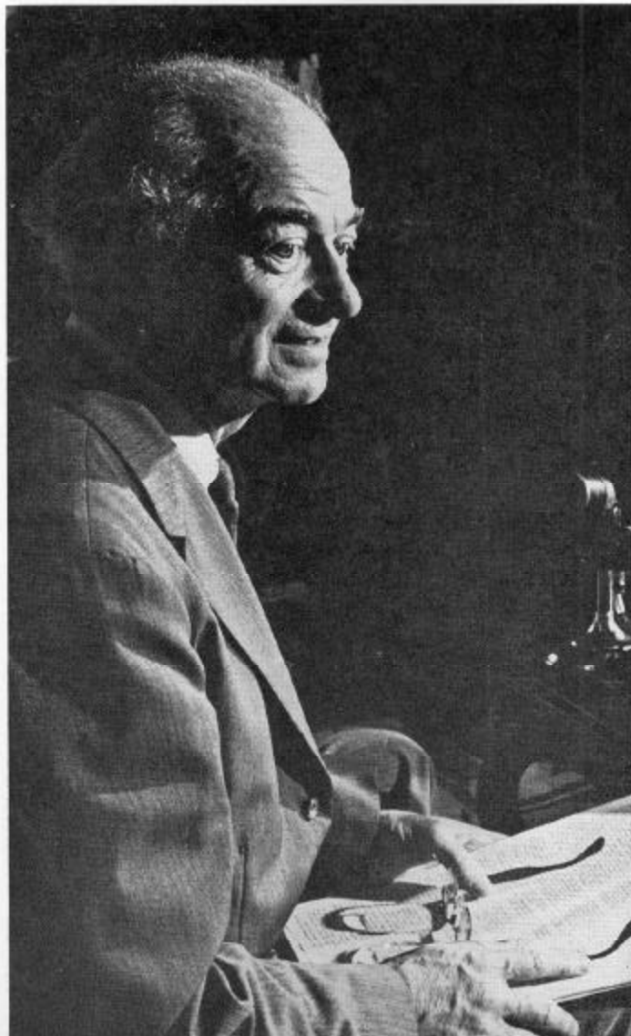
Linus Pauling, professor of chemistry, announces his appointment as a member of the Center for the Study of Democratic Institutions in Santa Barbara.