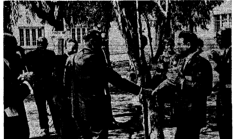
ENGINEERING AND SCIENCE