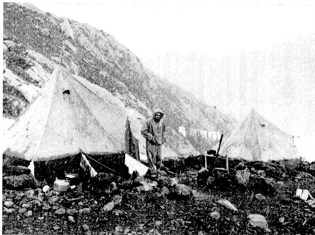
Research on Blue Glacier is usually conducted in August, since this is the driest month of the year there.