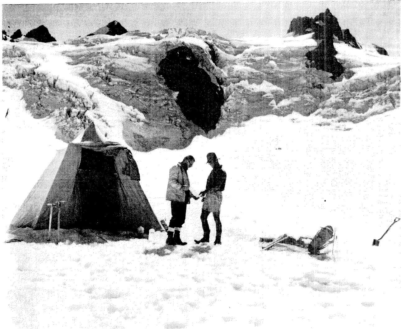
Senior engineer Jim Westphal and graduate student Hugh Kieffer examine a seismic record. In the new technique under development here, reflected seismic waves at a frequency of about 1,000 cycles per second are recorded. This frequency is almost ten times as large as that conventionally used in seismic exploration. The equipment of the coring operation is visible near the base of the icefall. At upper right is the summit of Mt. Olympus.