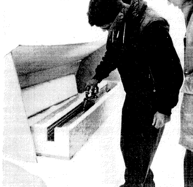
The core is flattened (using a gasoline iron). It is then sectioned to a thickness of 1 mm for optical examination.