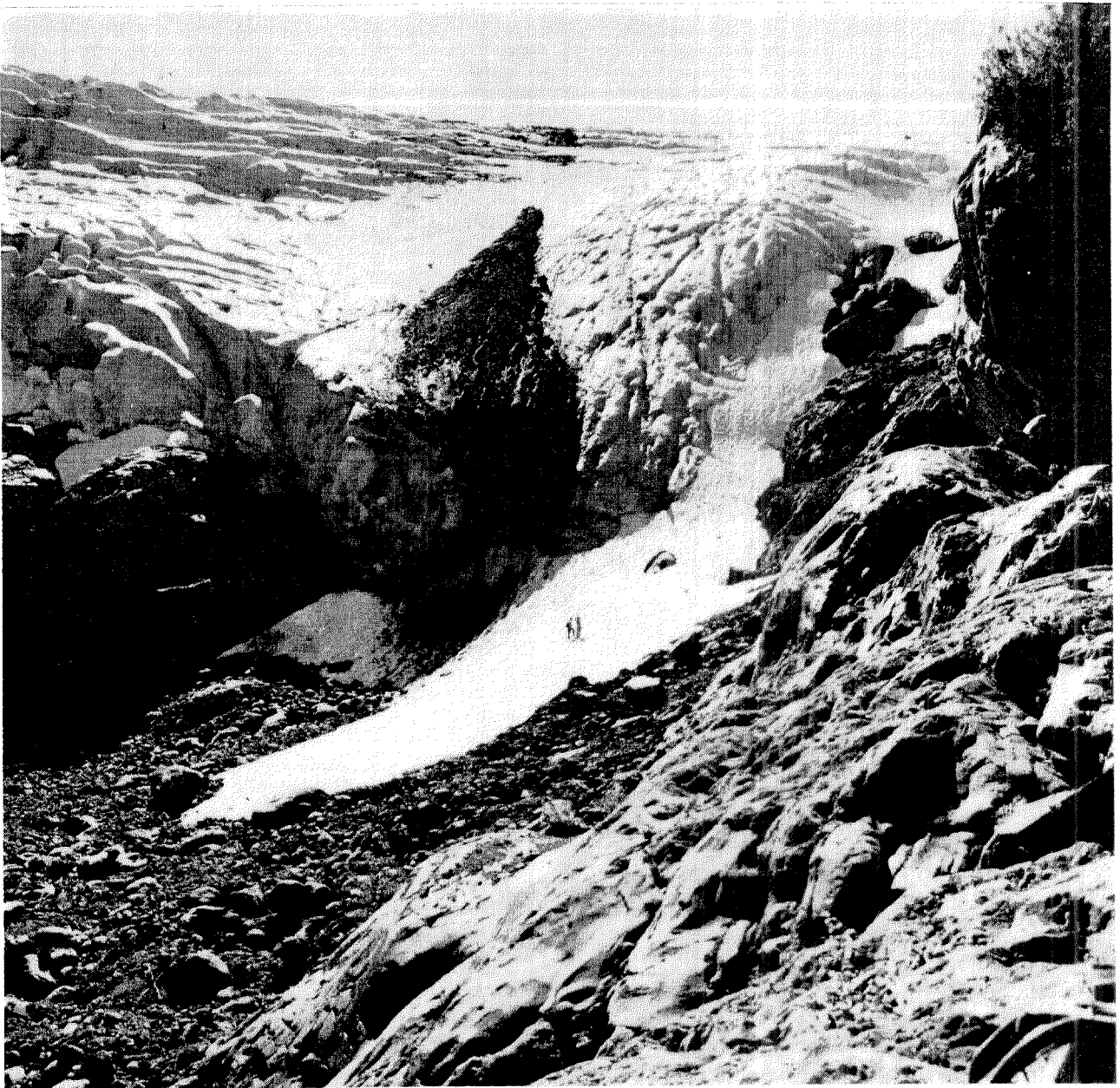
The position of the snout of Blue Glacier has remained remarkably constant for five years, although stakes placed in the ice, in a tunnel beneath the snout, move forward about 0.3 centimeters a day.