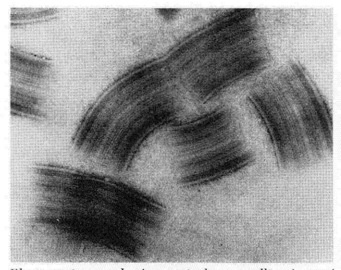
Electronmicrograph of a particular crystalline form of collagen in which the molecules lie side by side with no longitudinal displacement. The band pattern in each of the crystallites shown is a map or "fingerprint" of the molecular details. Magnification is 90,000 diameters.

of amino acids, which are the building blocks of proteins. Each chain is fashioned into a left-handed helix, or spiral. The three chains are wrapped together, right-handedly, to form a super helix of 35 turns about 1/85,000th of an inch long.