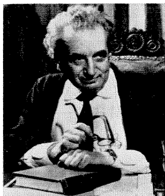
THEODORE VON KÁRMÁN 1881–1963

"This isn't fair," one of the students spoke up finally, expressing what was in everyone's mind. "If we all know the answers, everyone will get 100."