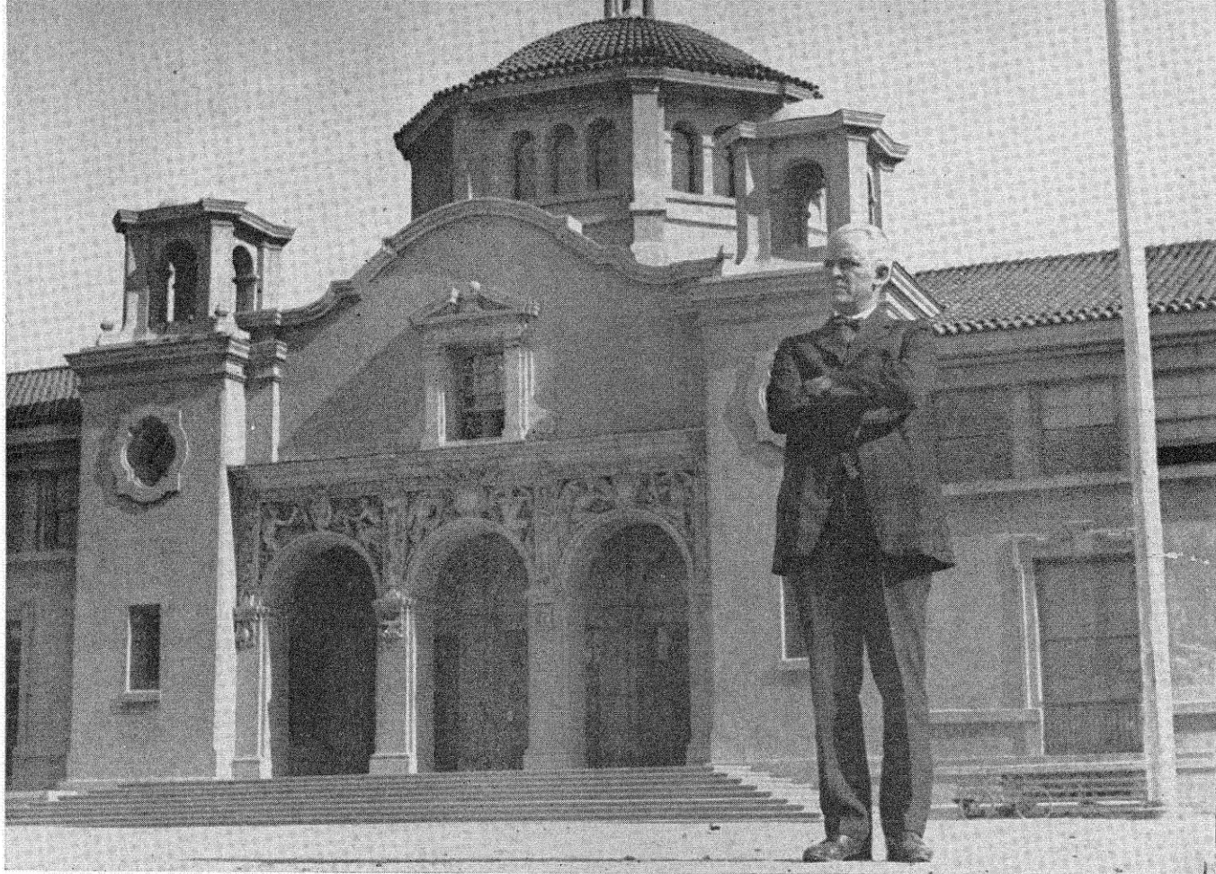
Robert A. Millikan, Chairman of the Executive Council of the new California Institute of Technology.