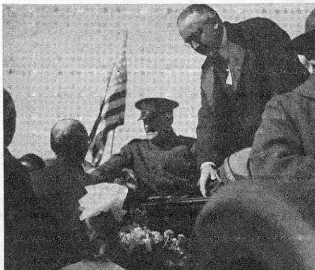
General Pershing tours campus with President Scherer.

In the autumn of 1918 Throop College started training enlisted men in the nationwide Students Army Training Corps program. Under the SATC, in which 500 colleges participated, all students over 18 became "enlisted members of the military forces." A mess hall and barracks to accommodate 300 men were erected on campus, and on October 1, 1918, the Throop College unit of the SATC officially began operations.