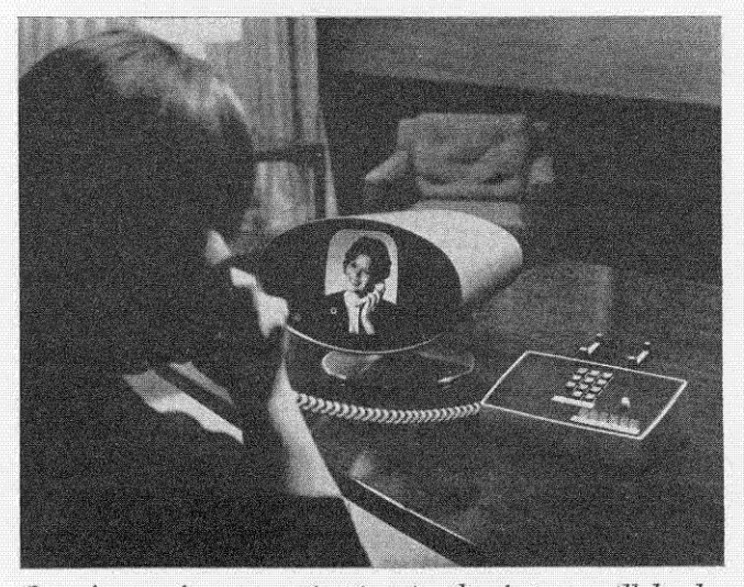
One form of communication in the future will be by person-to-person television.

By means of electrical communication, offices will