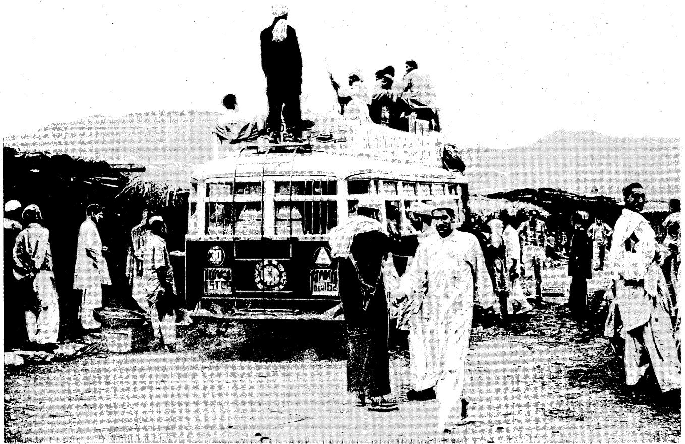
The "Dir Express" makes one of its numerous tea stops on the road through Pathan country from Dir to Ashret.

awar. Most of the people going north that day were going home on vacation after a winter's work somewhere in West Pakistan.