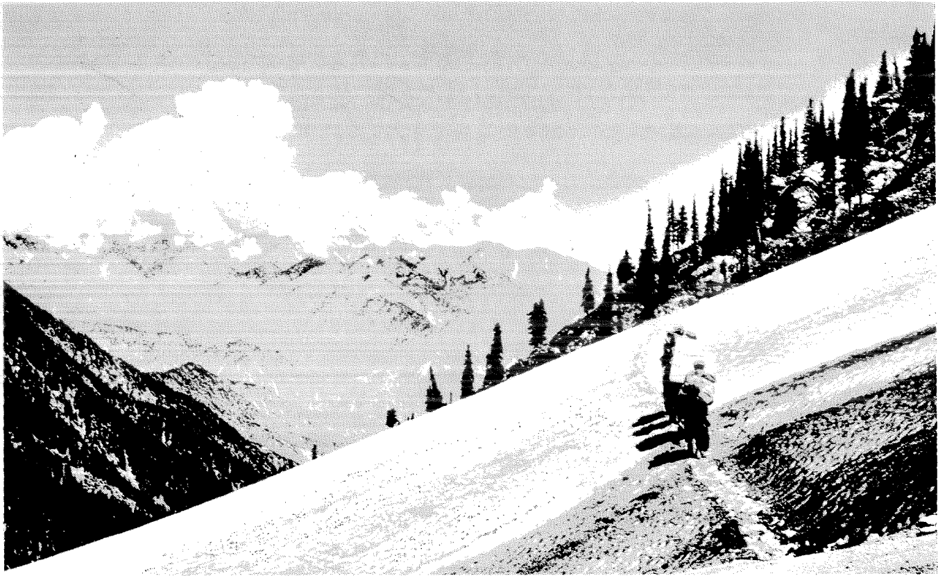
Where snowdrifts block the road, passengers and porters carry the luggage over the 10,500-foot Lowari Pass.

and students in transit. We ate a greasy supper next to a table of West Germans—technicians of some sort on holiday from their jobs in West Pakistan—and went to bed by the light of a kerosene lamp in a little room that smelled of urine.