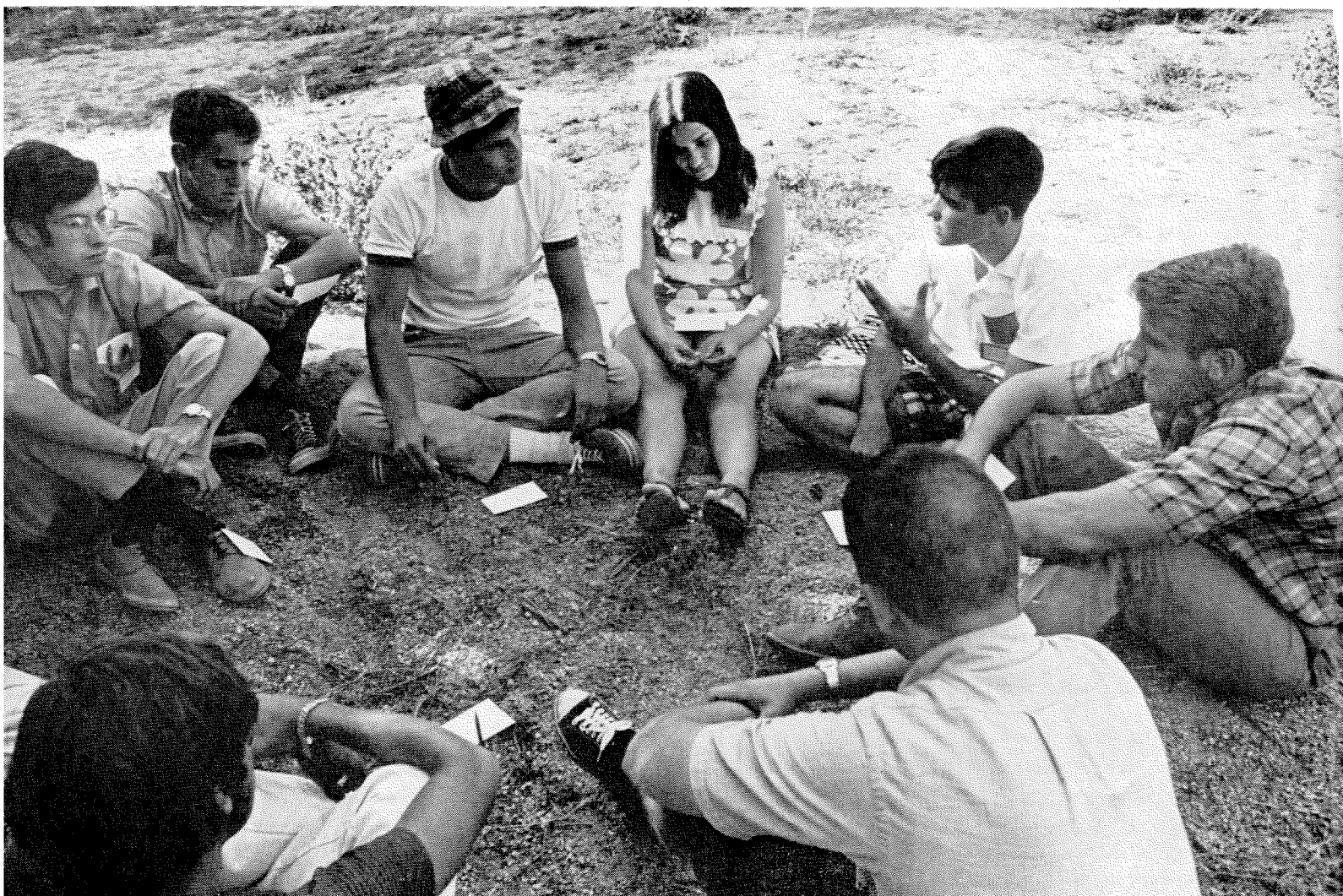
Freshmen at camp take part in small discussion groups with upperclassmen, faculty, and—if they're lucky—girls.