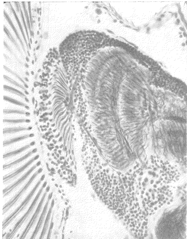
A horizontal section, 10 microns thick, through the eye of a normal Drosophila is stained with silver to show the nerve fibers. At left are the photosensitive elements of the eye that connect with the various optic ganglia.

Other non-phototactic mutants can be seen to have defects such as absence of photoreceptor cells, gross distortion of the ommatidial array, or degeneration of the neural elements behind the eye. Still, there is also a class of mutants whose eyes appear normal by microscopic examination, yet the flies show no phototaxis. Yoshihi Hotta of Caltech has begun to examine these by neurophysiological techniques. Even by the most elementary method, the electroretinogram, it can be shown that some of