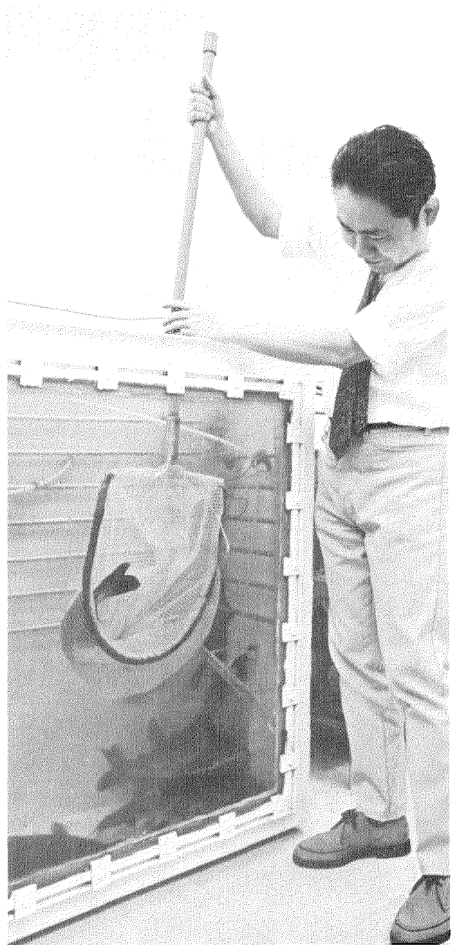
Naka's office equipment includes a unique feature—an aquarium stocked with research subjects.

There are three major layers of sensory cells be-