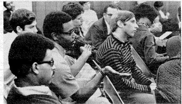
A briefing session, attended by participants, prepares Caltech students for "the actualities of ghetto life."

If the aim of the project was limited to showing liberal-minded Caltech students (for they were the only kind who participated) that Negroes are people who are just as kind, generous, and friendly as white people, then it succeeded overwhelmingly. The students' reception, in spite of the fact that one Caltech participant was beaten up as he walked along Fair Oaks Avenue the final afternoon of the program, was extremely hospitable. After only one day in the ghetto, students commented on the large number of blacks who uncritically accepted them as comrades, joked and laughed with them. After three days at a Head Start program center, one Caltech student half-seriously boasted that he was an "old hand" around the place. What was true where the students worked was even more true where they slept. Almost every family invited its guest to return some day, and many mothers described their guest as "one of the family." No participants had any reservations in their praise of this aspect of the program.