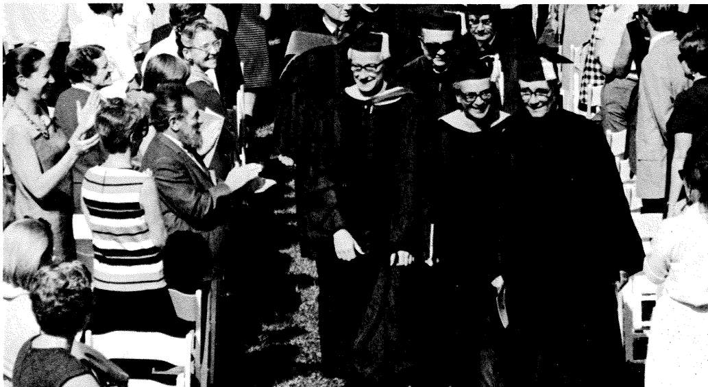
The Nobel Laureates in the academic procession picked up an added starter at 3:30 a.m. on Inauguration Day when Caltech's Murray Gell-Mann was notified he had won the 1969 Physics Prize. His fellow marchers are Caltech's Max Delbrück, 1969 co-recipient of the Prize in medicine and physiology, and his boss—Carl Anderson (chairman of the division of physics, mathematics and astronomy), physics winner in 1936.