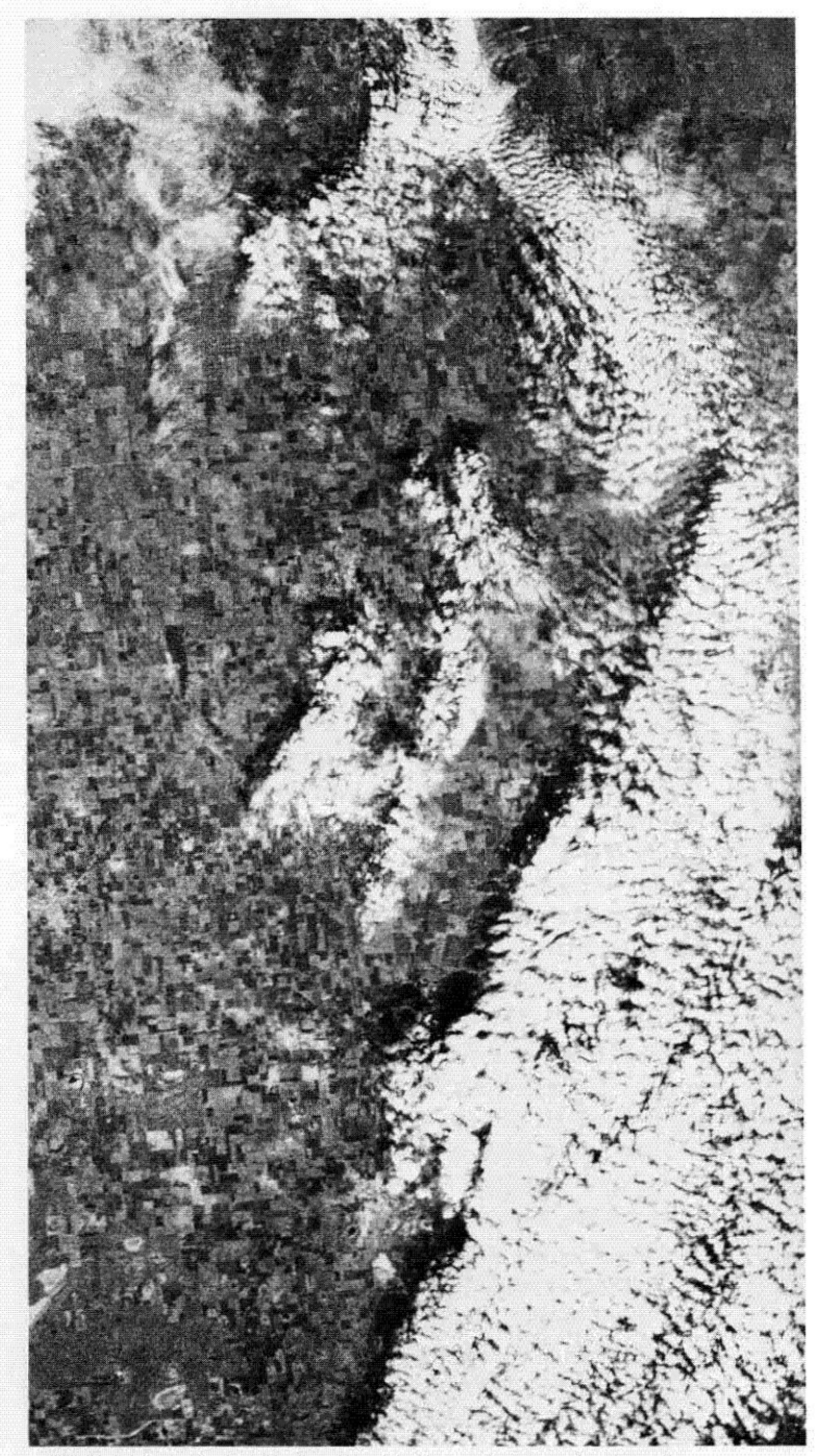
A portion of an Apollo 6 photograph of a typical populated region of the planet Earth—at a resolution of about one-tenth of a kilometer—reveals a fine checkerboard pattern which is the result of the human passion for order, geometry, and territoriality.

The conclusion is that with a fair number of photographs at a resolution of 100 meters or better it is very easy to detect intelligent life on Earth. At resolutions worse than