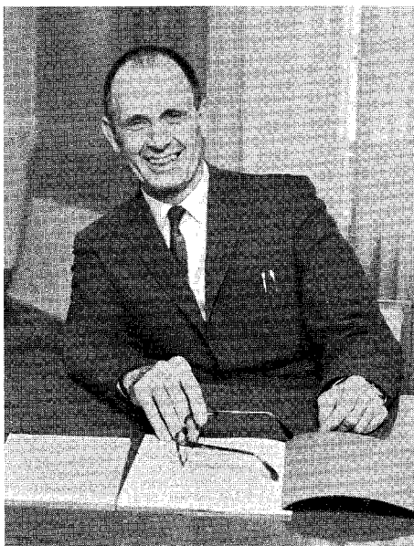
NAE member Clauser