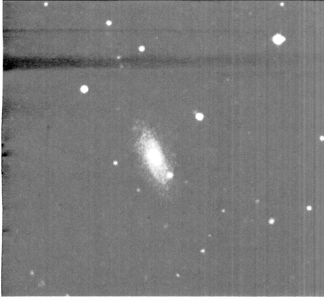
A spiral galaxy in the constellation of Leo—photographed in February 1950 (left) and again four years later (right)—shows one significant difference. In the second picture a brilliantly clear supernova has appeared on the southwest edge of the cloud-like galaxy. The outburst probably occurred about 200 million years ago, and the light from it has been speeding toward the earth ever since.

have been caused by exploding stars which were members of the respective galaxies themselves, and therefore supernovae.