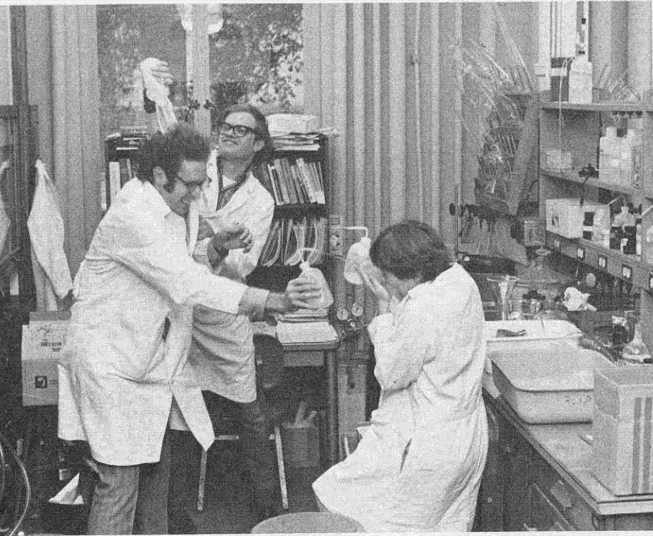
effectively ending the formal photographic session . . .