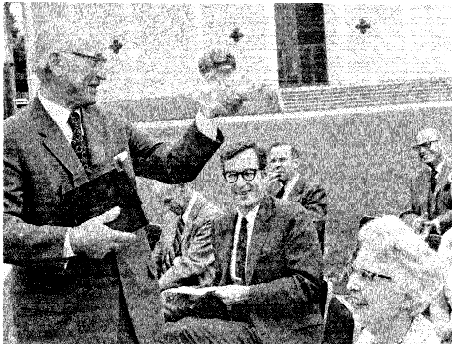
Arnold Beckman, chairman of the board of trustees, was honored at special ceremonies marking the beginning of construction of the behavioral biology building. He received a plastic reproduction of the human brain.