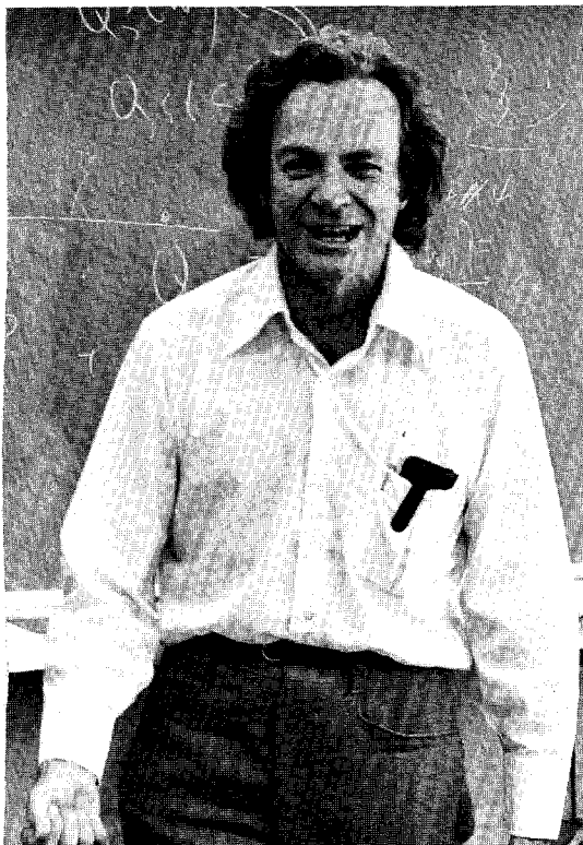
F Feynman—"Have absolute scientific integrity."