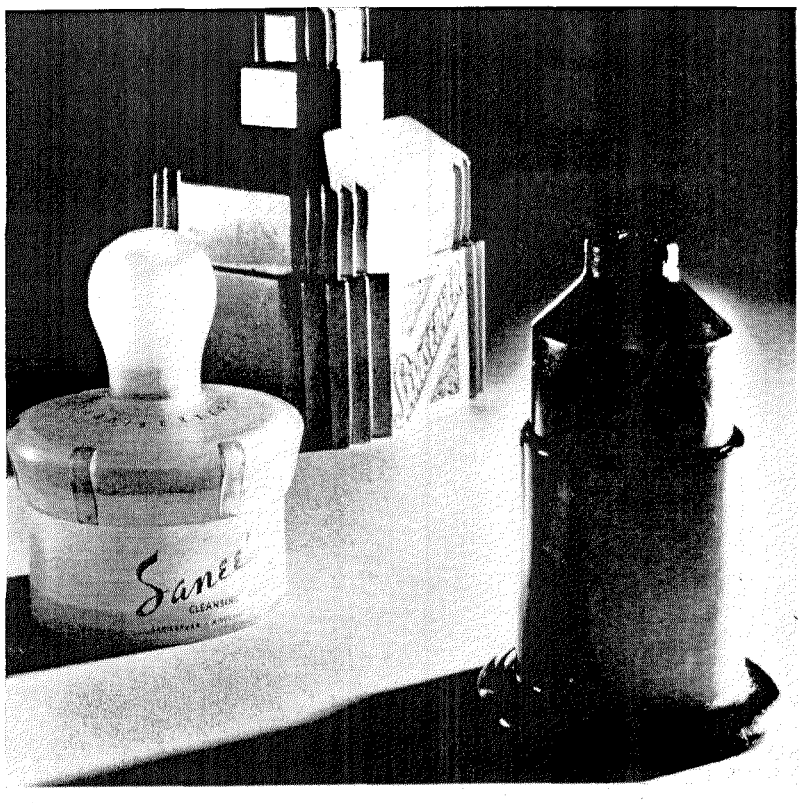
Above: An illustration of the progress in design from the inventor's model (on right), through the merchandiser's improved type, and finally to the industrial designer's finished container in plastics (on left), which combines distribution packages as well.—Designed by Virginia Merrill.

Good tools are obviously beautiful to a good mechanic because of their ability to turn out the work. Their appearance, due to the utilization of new processes and materials such as profiled steel and electric welding with their resultant lighter weight, lower cost, quicker delivery, does not directly concern the mechanic. Yet offer him a job in a new plant where they have all the latest tools, and he will think and speak first and often about the new plant, brag about the latest thing, etc., even though the new tools may not turn out more or better work than he turned out on the big, heavy and expensive power wasters he used before. If he does turn out more work and take better care of his tools, it will be largely because of some change the new surroundings have produced in him. Living with modern design produces a feeling of which we all are capable but the exact reasons for which few can analyze, and it is no doubt this for which we strive in our search for the "New."