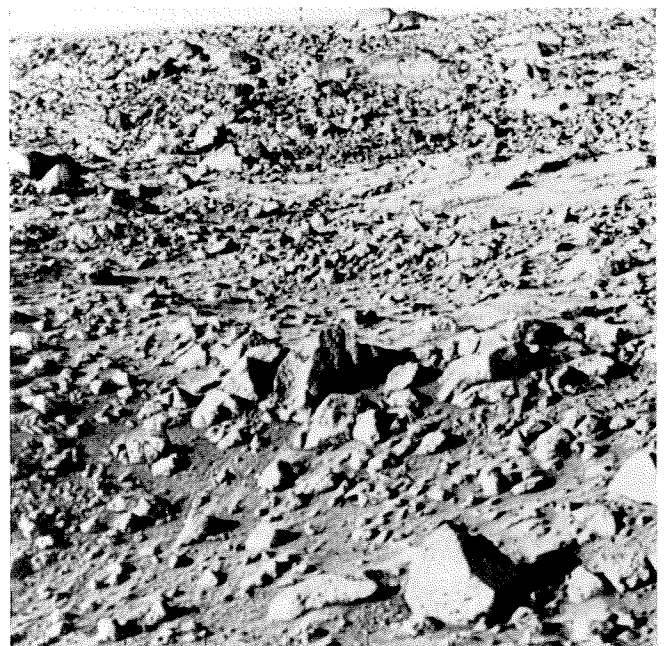
Viking 1 took this high-resolution picture on July 22 — its third day on Mars. The photo shows numerous angular blocks ranging in size from a few centimeters to several meters. The surface between the blocks is composed of fine-grained material. Accumulation of some fine-grained material behind blocks indicates wind deposition of dust and sand downwind of obstacles. The large block on the horizon is about 13 feet wide. The distance across the horizon is about 110 feet.

A FTER a journey of 213 million miles that took eleven months, a U.S. spacecraft set down on Mars on July 20. While the Viking 1 orbiter continued to photograph the planet from above, the 1300-lb. Viking lander began taking pictures of its surroundings — besides performing a series of intricate scientific experiments. On September 3 a second scientific station went into operation on Mars when the Viking 2 lander was brought down 4000 miles from the landing site of Viking 1. On these pages — a small sample of the exciting pictures coming back from the Viking vehicles. □