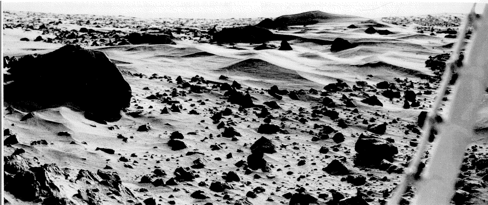
This spectacular picture of the rock-strewn Martian landscape surrounding the Viking 1 lander shows a dune field with a number of features remarkably similar to many seen in the deserts of Earth. Viking scientists have studied areas very much like this in Mexico,

and in California — specifically in Kelso, Death Valley, and Yuma. With maximum contrast the dramatic early morning lighting — 7:30 a.m. local Mars time — reveals subtle details and shading. Taken on August 3 by the lander's camera no. 1, the picture covers 100°,