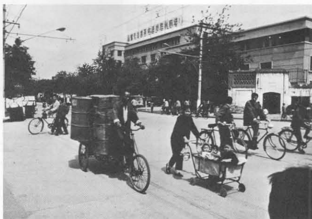
At times it is impossible to cross the street because the bicycle traffic is so heavy.

The same contrast characterizes transportation. Most people travel on foot, or on the thousands of bicycles that are constantly whizzing down each main street, or on the overcrowded shiny new buses. At times it's impossible to cross the street because the bicycle traffic is so heavy. But we, as allegedly distinguished visitors, are taken everywhere in a fleet of state-owned cars that crash through the foot and bicycle traffic with a furious blowing of horns. Protocol dictates that Murph must ride in the lead car, and he was fated to ride alone until he labored through an explanation of Stan Avery's distinguished status as chairman of the