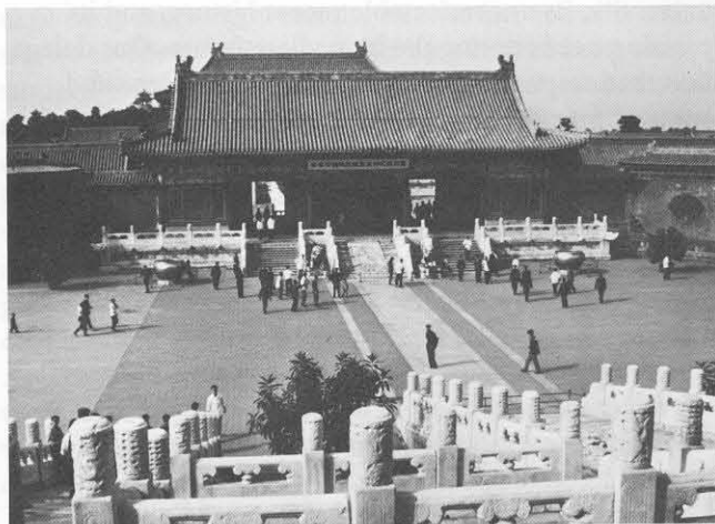
The Imperial Palace at Peking

Russian system that separates teaching from research. Before that the country was torn up by the civil war and the war with Japan.