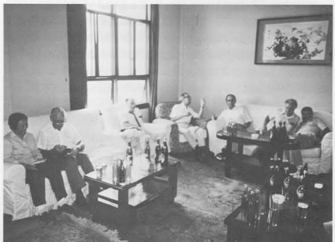
A typical reception—with a choice of beer or orange soda.

The new "pragmatic" government that has gotten rid of the Gang of Four is sharply aware that their country has lost at least ten years of teaching and research, and in practice the loss must amount to a full generation, because before the Cultural Revolution, China suffered years of imposed Russification, during which the universities tried unhappily to copy the