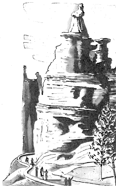
"Queen Victoria," Bryce Canyon National Park, Utah

THIS YEAR enjoy the beauties of your National Parks—the rugged, rainbow vistas of Zion, Bryce, Grand Canyon—the gorgeous scenes and breath-taking phenomena of Yellowstone.