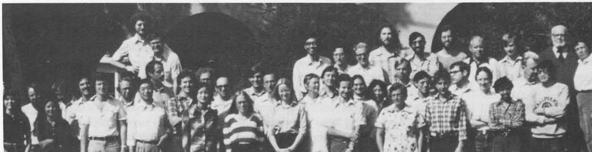
A recent picture of most of the Kellogg gang.

Good laboratory facilities lead to good physics. Charlie Lauritsen believed that all his life. The Kellogg gang has grown considerably since Charlie's time; it still has fun doing good physics. □