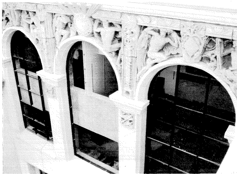
Over the course of a couple of months the Calder arches began to look quite at home.

pilasters on campus — perhaps nearby in the eventually landscaped courtyard enclosed by the new Beckman Laboratory, Alles, and Kerckhoff.