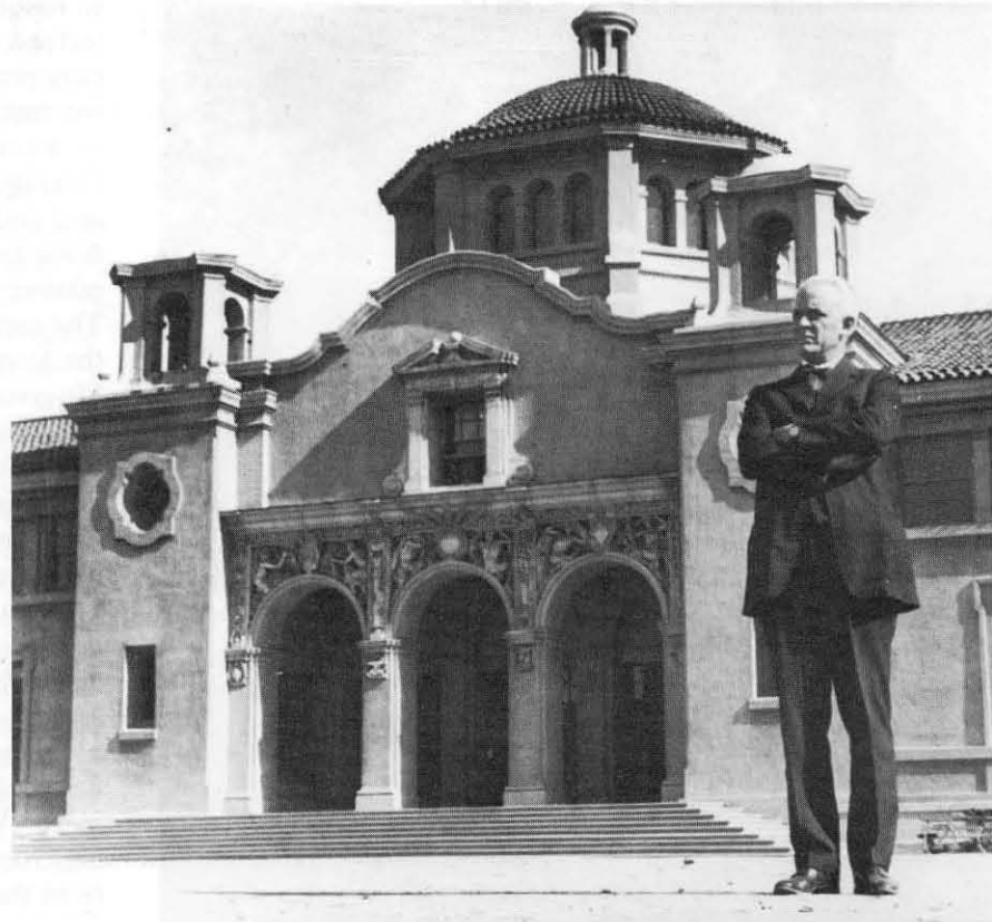
Right: Robert A. Millikan stands in front of Throop Hall.