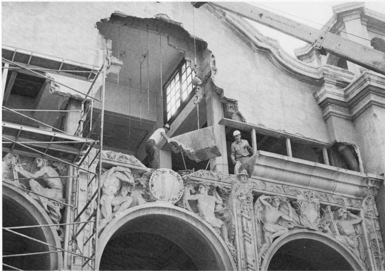
Below: Dismantling the Calder arches from earthquake-damaged Throop proved to be surprisingly easy.