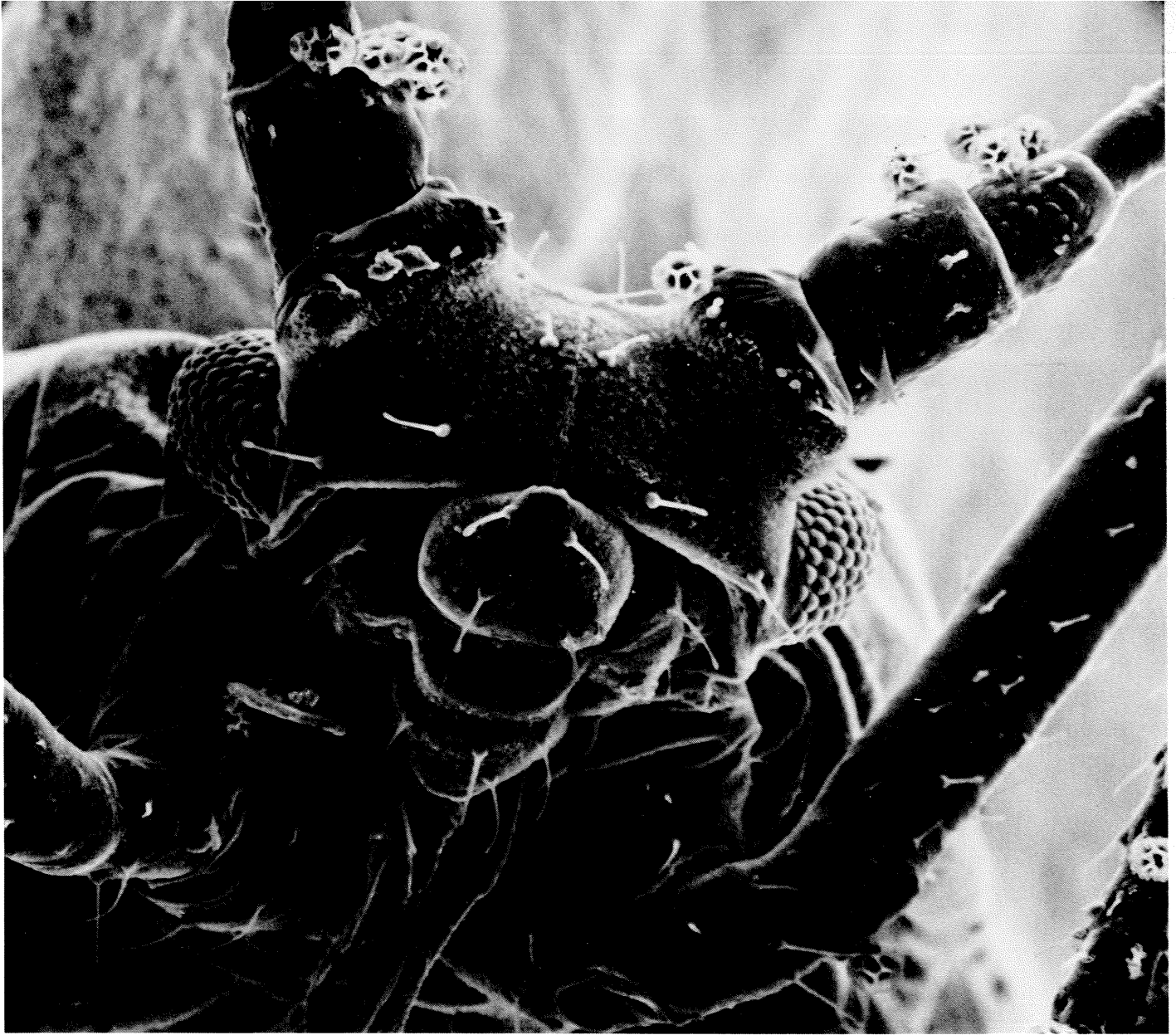
This nightmare is a Hemipteran (alias "bug") magnified 400 times. Revel found it on one of his African violet plants. The honeycombed objects on its antennae are pollen grains from the violet's blossoms.

SEMS have been used in industry for about ten years, but only in the last few years have the quality and resolution of imaging improved enough for them to be useful in basic scientific research. The Caltech SEM is about eight months old, and Revel and many of his colleagues are still getting acquainted with its capabilities. In addition to scanning cells, it has been used to look at the way amoebae aggregate to form slime molds, the appearance of normal and cancerous cells, the origin of nerve cells, the development of chicken embryos, the detailed surface structure of fruit-fly mutants, and the microscopic substructure of various materials like rocket propellants, the "teeth" of mollusks, and bits of meteorites.