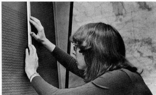
A technician measures the amplitude and arrival time of an earthquake on a microfilm display of a seismograph record.

The 50th anniversary of the Lab was celebrated on December 2 and 3, 1977, when faculty, students, staff, alumni, friends, and associates gathered at Caltech for a two-day open-house-seminar. Honored guests included