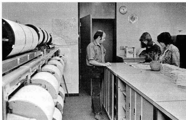
Reading one of the records from the imposing array of seismograph recording drums in the Seismological Laboratory.

An all-day symposium covered the full range of activities at the laboratory, including real-time tectonics, ultra-high pressures, plate tectonics, the Seismic Array, and southern California crust and mantle and attenuation and creep in the mantle. Caltech is at the forefront of research in all of these areas. □