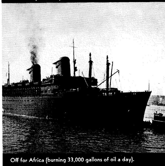
Off for Africa (burning 33,000 gallons of oil a day).

duce for a short time. But most wells cannot sustain their potential rate for any length of time. Unfortunately this rate has been measured, optimistically estimated, and quoted, perhaps because it is more tangible than significant.