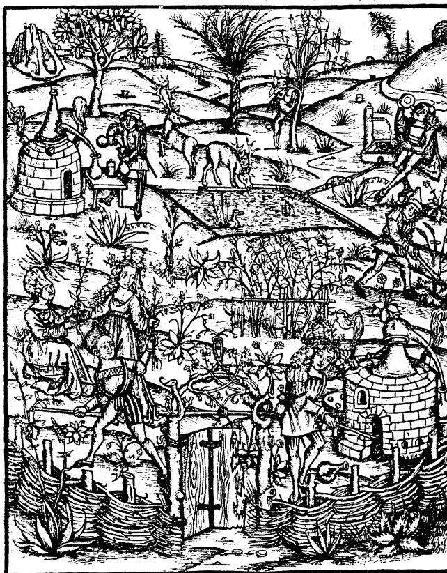
un getruckt durch den wohlgeachte Johannem grueninger zu Strassburg in den achte tag des meyden als man zelt von der geburt Christi funfzehnbundert. Lob sy got. Anno 1500.