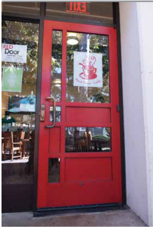
The RED DOOR CAFÉ

DABNEY LOUNGE. Back in the 1980s, community folk-dance recreation sessions were hosted there on Tuesday nights, and I used to walk over from my grad-student office in South Mudd to meet my Dad, who was a longtime participant. Eventually I started dancing there too. In late 1987 I married a JPL engineer in Dabney Lounge and Gardens. We all danced, of course.