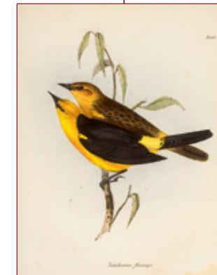
Left (book): Etudes Sur Le Vin (with notes on the page facing the title page by the author, Louis Pasteur). Above: Finch from Charles Darwin’s Zoology of the HMS Beagle , 1839–43, The Huntington Library, Art Museum, and Botanical Gardens.