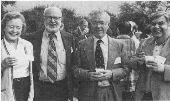
Together for the 50th birthday of Kellogg last November, the authors of 1957's classic paper on the synthesis of elements in stars — Margaret Burbidge, Fowler, Sir Fred Hoyle, and Geoffrey Burbidge.