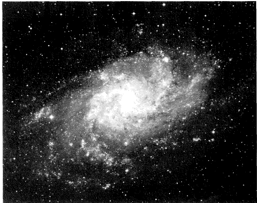
In this Palomar Observatory photo, M33, 3 million light years from earth, displays its spiral structure. The galaxy is thought to resemble the Milky Way, although smaller.