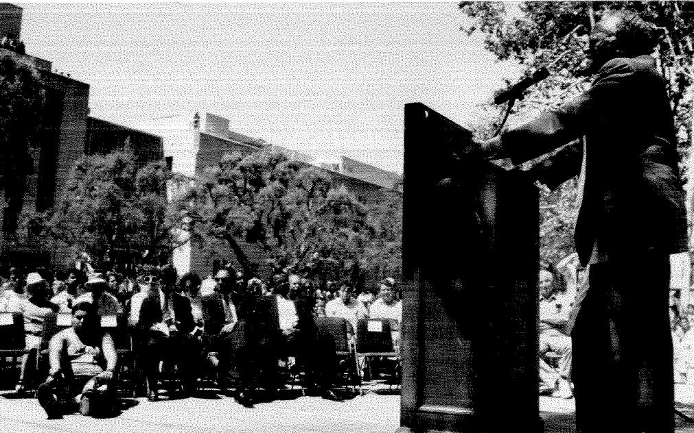
Archbishop Desmond Tutu of South Africa addressed the Caltech community on May 22. His speech, given on the Olive Walk, drew a capacity crowd, some of whom found the view best on nearby rooftops.