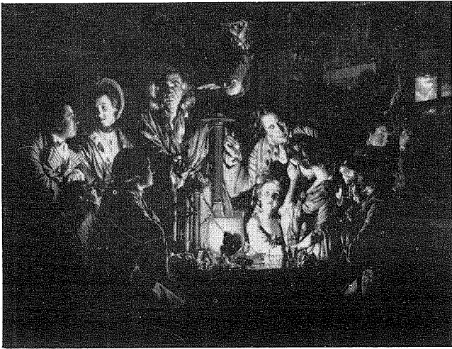
The Air Pump