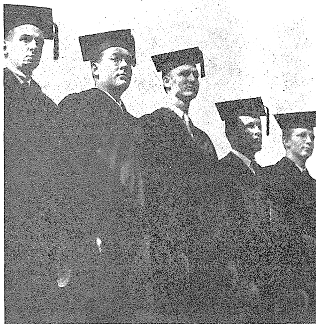
Class of '50