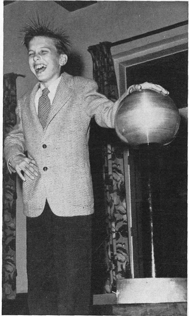
Young visitor undergoes a hair-raising experience in Fleming House, while testing the powers of home-made Van de Graaff generator which students had on display