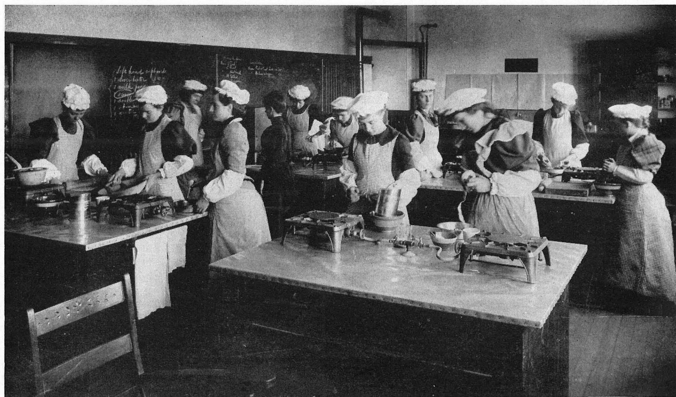
Time was when women students were no rarity on the campus—as witness this picture of frantic activity in the cooking room of the old Throop Polytechnic Institute, sometime early in the century.

She is at Caltech on a Skinner Fellowship in Chemistry, sponsored by Mount Holyoke College. Her present research is in the field of theoretical organic chemistry.