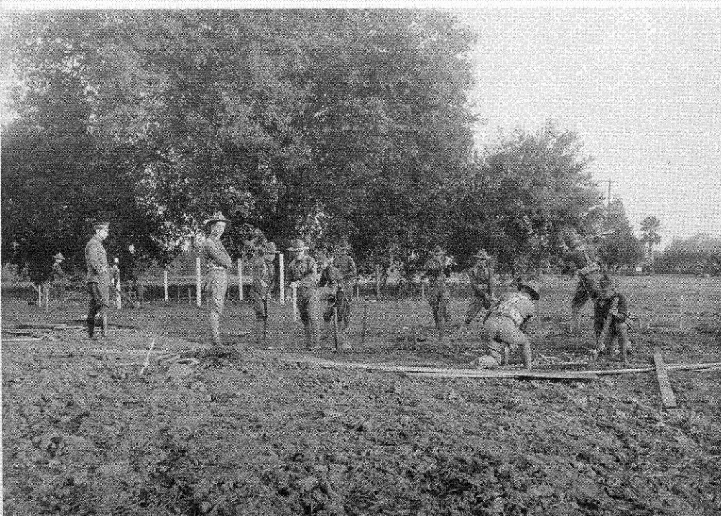
LEFT — Survey crew studying military barbed wire entanglements — apparently on the site of the present Athenaeum.