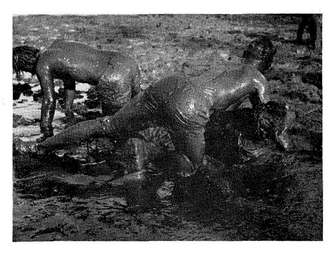
SOPHS won all events, including tire spree (above) and horse-and-rider contest (below). The victory was strictly Pyrrhic.