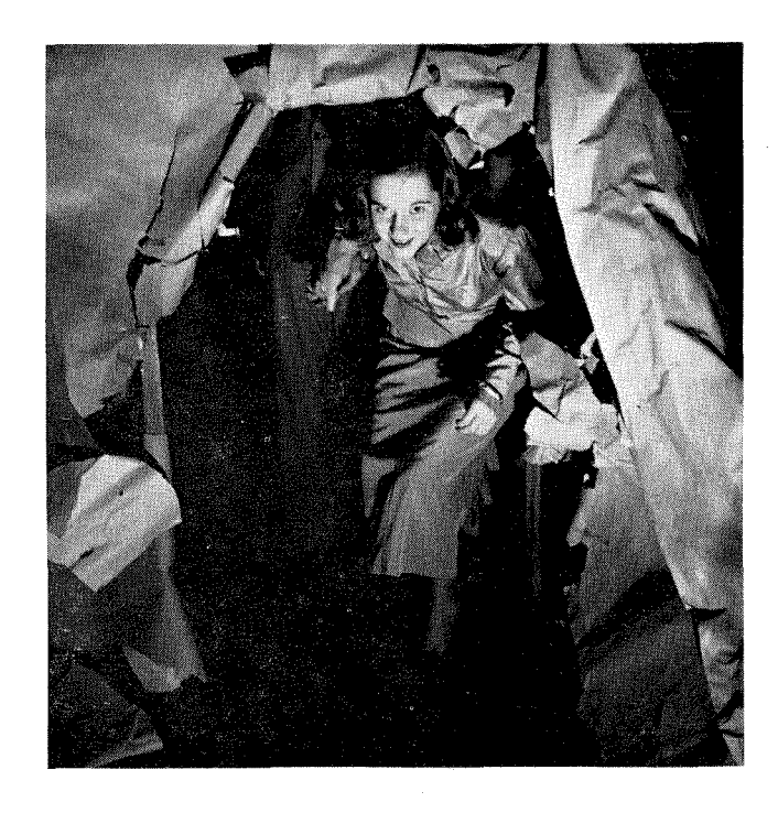
INTERHOUSE DANCE found Dabney turned into a postatom-bomb cave. Dignity went out the door as guests came in.