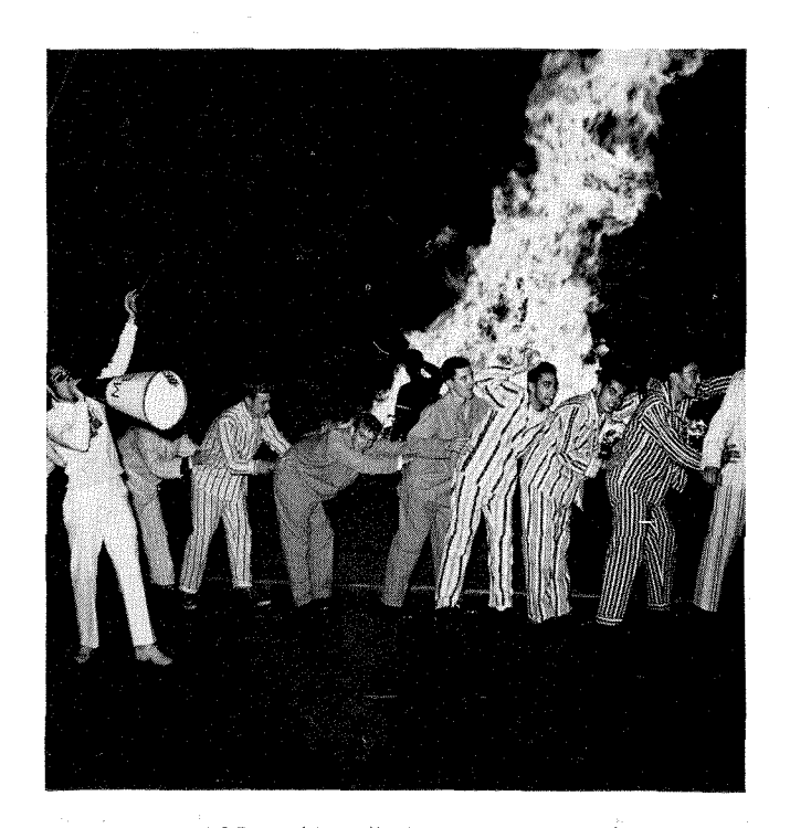
STUDY IN CORN, this collegiate scene, set up by newsmen, was recorded as well by our shocked student photographer.