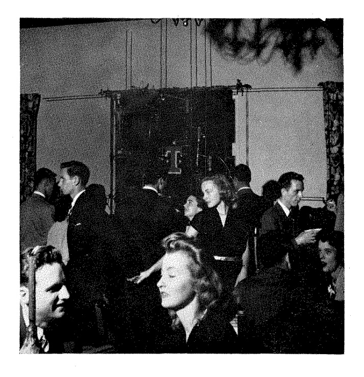
FLEMING HOUSE, where theme was "Mutiny in the Monastery," featured a handsome, inefficient still (background).