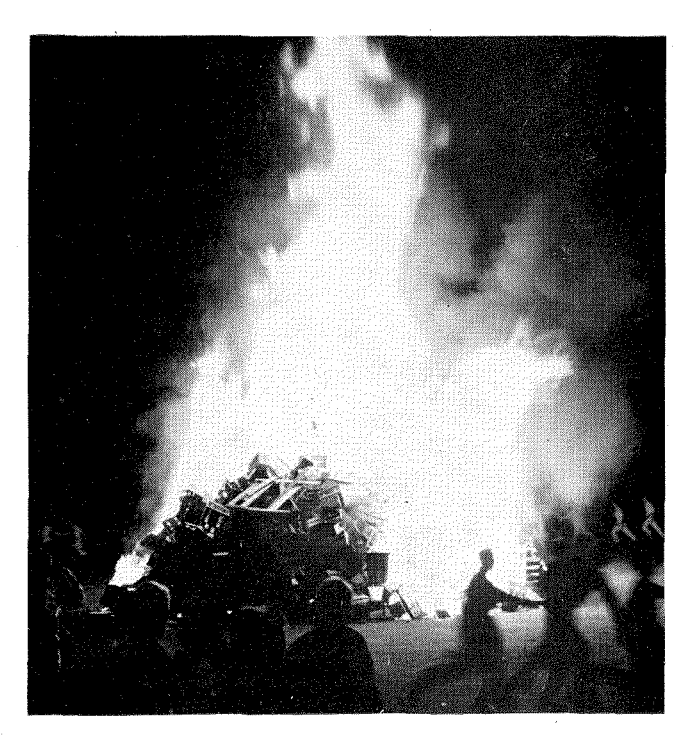
HIGHLIGHT of the rally is always a blazing bonfire, fed by frosh-foraged lumber, crates, and an occasional outhouse.