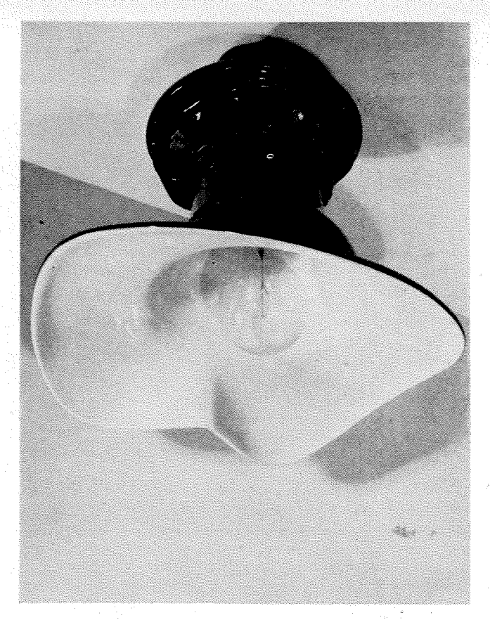
FIG. 2—Ceramic street light reflector.

The design of any new ceramic product requires that the designer have a working knowledge of the material and various processes used in the production of ceramic ware. Glazed ceramics present certain advantages as a material for light reflectors, such as excellent light-reflecting characteristics, resistance to weathering, and cheapness. On the other hand the low shock resistance of ceramics is a disadvantage.