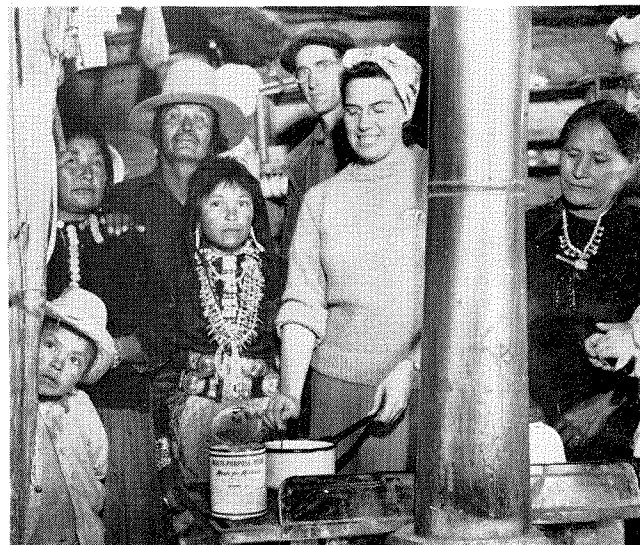
Multi-Purpose Food has proved a boon to Navajo Indians—though this demonstration isn't stirring up much interest.

It is this example I have in mind when I say that we have in our hands the scientific tools and the technology to prepare foods to meet almost any situation. The use of industrial and agricultural by-products insures their low cost; vitamin concentrates, synthetic vitamins, and commercial minerals will make them as nutritious as an expensive diet scientifically selected from natural fresh foods. In no other way can the needs of such countries as China, India, and even portions of Europe today be met. It isn't necessary to force people to eat brown bread if they prefer white. It isn't necessary for people to get scurvy, if the good food sources of Vitamin C—citrus fruits, tomatoes, cabbage, potatoes, and a few green leafy vegetables—are not available or are too costly. Freedom to eat what we like and still be well-nourished is one of the new freedoms which science and the technology of foods offer to the world if it will only take it. That offer has not yet been accepted.